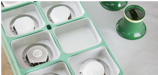
In the new generation of TruMicro Mark Series 2000 ultrashort pulse lasers, the pulse duration can be variably set between 400 femtoseconds and 20 picoseconds. This enables fast, burr-free engraving of up to 100 micrometers deep in all precious metals that can be reproduced at any time with consistent quality.