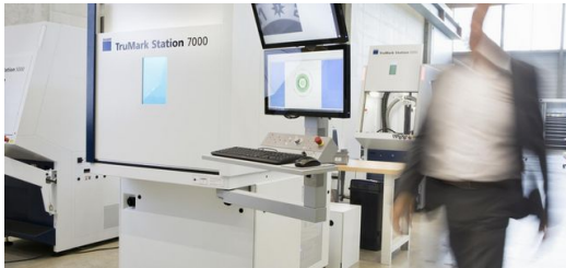
The edition engraving for the Meister S Chronoscope Platinum Edition 160 was created in a TruMark Station 7000 equipped with the new generation TruMicro Mark Series 2000 ultrashort pulse laser.

Clearly, everything about this timepiece must be perfect down to the smallest detail. The case, pushers and screw-down crown of the Meister S Chronoscope are made of highly polished platinum. The hour counter of the stopwatch, integrated into the cool silvery shimmering dial, bears the limitation number, as does the watch back. "Each watch is absolutely unique," says Stotz with enthusiasm. "The 12 numbering on the dial and the edition engraving with limitation number on the watch back make it unique. To ensure that this unique selling point is also perfect, we turned to our contact Ralf Motz at TRUMPF."