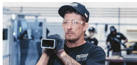
<p>The right attitude: To work at PTL, you need commitment and the willingness to learn something new every day.</p>