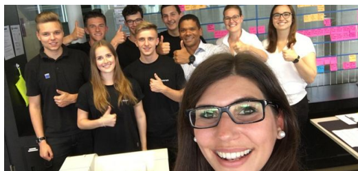
The training department designs, builds and operates its own machine for training purposes, running through all the same stages that you would need to develop a "real" machine. Let's see how it works!

Agile collaboration also takes place at TRUMPF training department at headquarters in Ditzingen. The idea is to use agile methods right from the start, just as people are embarking on their careers. Experts from different areas work together for the training project. Challenges can be solved by using agile methods.