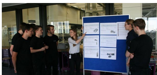
The idea is to actively involve 170 students and apprentices from different departments in the project over the next three years, and to accompany them on that journey.