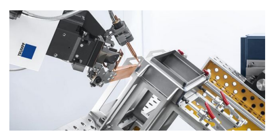
The FusionLine joining technique can be used to join parts, even when this involves the bridging of gaps. It smooths out any unevenness during the welding process and closes gaps up to one millimeter wide. That makes it possible to use the laser on many parts that were originally designed for conventional welding methods.

— Exploiting the full potential of laser welding