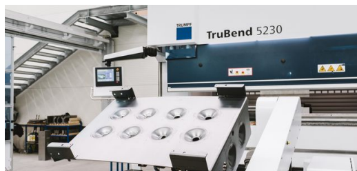
For boiler plate production, half-shell-shaped recesses must be made in the plate. First a hard nut for the TruBend Cell 5000. Today, the bending cell handles the forming process fully automatically, saving a lot of time.