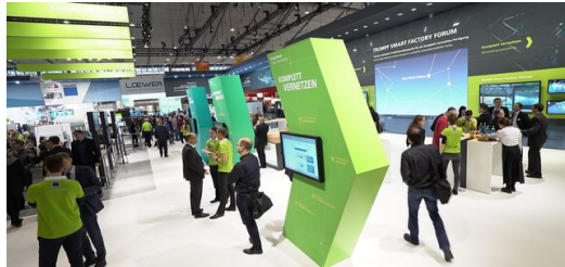
Thanks to the green T-shirts of the TruConnect consultants, visitors who had questions about the TRUMPF solutions for the Smart Factory quickly found what they were looking for.