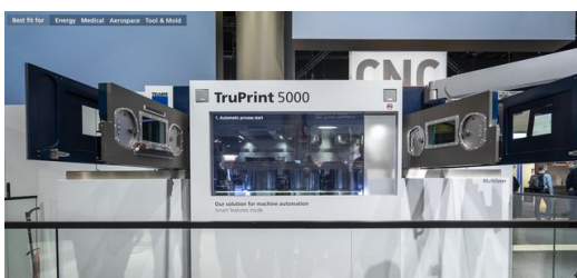
The TruPrint 5000 featuring auto-start

The large-format TruPrint 5000 system featuring auto-start was an eye-catcher. This solution speeds up 3D printing to boost productivity. The Formnext demo showed visitors how the substrate plate with a zero-point clamping system automatically slides into the proper position. Speaking at the press conference, Tobias Baur, General Manager of TRUMPF Additive Manufacturing, said that automated in-machine solutions like this are the first step toward the longer-term goal of automating upstream and downstream stages in 3D printing.