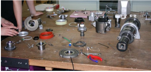
With some people spending periods of time at vocational colleges and following the dual study system, the challenge is that you don't have all the participants in the same place at the same time. On top of that, not all the apprentices on the technical side of things have access to their own computer.