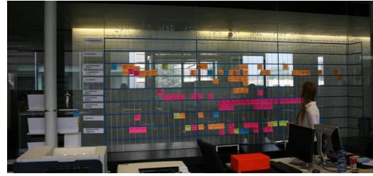
The traditional kinds of project-management methods that require a computer didn't provide proper transparency to each and every individual.