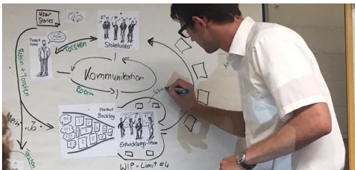
The team running the training project is supported by the Project Competence Center, which provides advice on agile practices and conducts training sessions on agile methodologies.