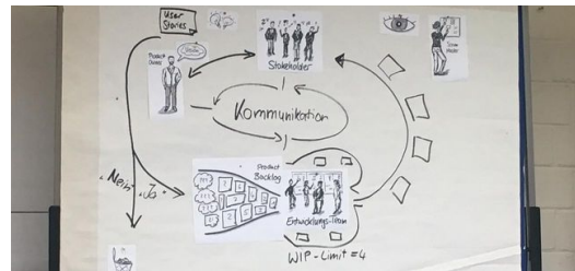
Just like in all projects, there are no fixed formats or rigid methods of agile collaboration. Each project team has to make its own decisions on which methods they will use, and in which format.