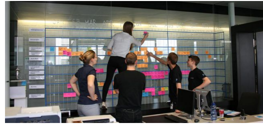
But by using pinboards and workshop boards, the team keeps all the individual stages and process visible at all times, so everyone is kept up to date on the current status.