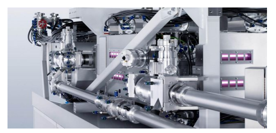
The TRUMPF Laser Amplifier is based on the technology used for the continuous wave CO2 laser and operates in a performance range exceeding ten kilowatts. In five amplifier stages it boosts a CO2 laser pulse of just a few watts of mean power more than 10,000 times, outputting more than 30 kilowatts of mean pulse power.

Anyone searching for an alternative to the demanding technology associated with EUV lithography will find that there really isn't one. The optimization of previous technology, based on a laser beam with a 193-nanometer wavelength, has made it possible to image even smaller structures when exposing the substrate. This is done, for instance, by multiple exposure – multiple patterning – where each exposure step is carried out twice or four times. The effort for the many steps is high and therefore increasingly uneconomical.