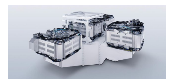
Since the beginning of 2014 TRUMPF has delivered its third-generation laser systems to ASML in Netherlands, the only manufacturer of EUV photolithography systems in the world.

Secondly, it is only the wavelength of 13.5 nanometers that makes it possible to manufacture the layer systems required for optical imaging at sufficiently high reflectivity. Refractive optical elements – such as lenses – absorb this wavelength. That is why EUV systems work exclusively with mirrored optical elements. The very short wavelength is also the reason why the entire process has to take place in a vacuum, since air would also absorb the EUV radiation.