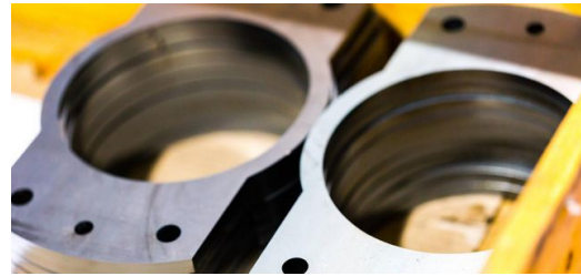
Thomas Sattler: "The relationship of bore diameter to sheet thickness is fantastic, and we can mostly do away with the extra milling we had to do in the past."

Sattler is also impressed by having the option of drilling small holes in steel sheets 20 millimeters thick: "The relationship of bore diameter to sheet thickness is fantastic, and we can mostly do away with the extra milling we had to do in the past." He has also been impressed by the BrightLine fiber, FlyLine and automatic nozzle changer functions. "Thanks to BrightLine fiber fusion cutting, we can achieve a high-quality edge when cutting stainless steel, even when the contours are tight. FlyLine allows us to process thin sheets faster than ever before. And, because we're always changing from thick to thin sheets, the automatic nozzle changer saves us additional processing time – and the 8 kW laser is lightning fast as it is," he says.