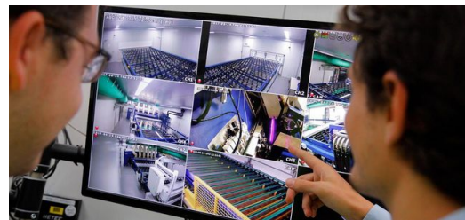
Heating the glass coating very briefly to a high temperature is an essential part of the hardening process. The glass experts at Saint-Gobain spent five years working on their rapid thermal processing method.