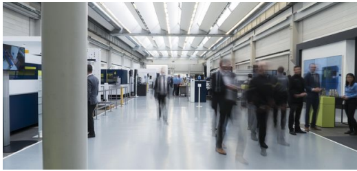
Visitors also crowded to the 2D laser cutting machines.