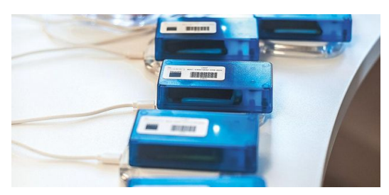
Prototype: What the markers looked like during the test phase.