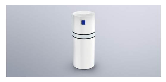
Satellite: Satellites installed in the production facility pick up the markers' location and transmit the information to an industrial PC.