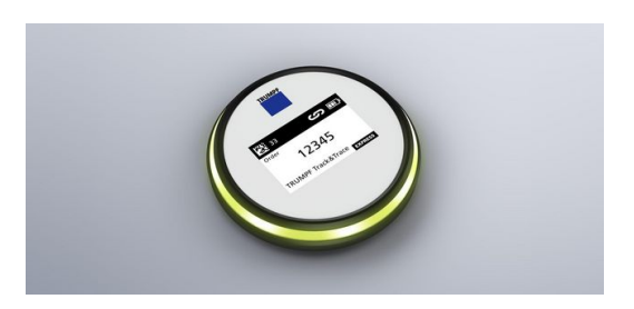
Marker: Users can transfer the order number and other information digitally onto the e-ink display of the marker. They can then simply place them on or beside the parts of the order.