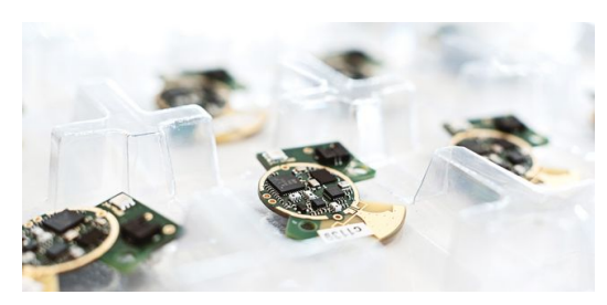
Ever smaller chips: A crucial part of the process.