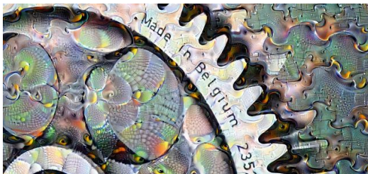
The dream in the workpiece?