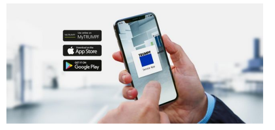
<span lang="EN-US">The TRUMPF Service app is available for download from Google Play or the Apple App Store.