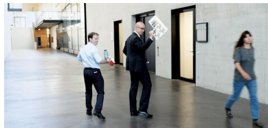
The team of people from the product group, development, purchasing, production, sales, service and project organization departments meets at regular intervals to discuss how development on the TruLaser Center 7030 is progressing.