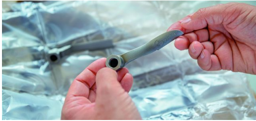
All one piece: Redesigned by Bionic Production, this nozzle offers gentle curves straight from the 3D printer.

The new nozzle is efficient in many different respects. The flow of coolant has been optimized, reducing pressure losses by up to 20 percent. That means you need a lower pressure - and less energy - to achieve the specified coolant exit velocity. The curved channels and optimized jet trajectory take the lubricoolant to the precise place it is needed, delivering no more and no less than is required to carry out the process in an optimum manner without causing thermal damage to the part. This reliable and automated solution for delivering lubricoolant eliminates factors that may have previously caused hold-ups in the manufacturing process.