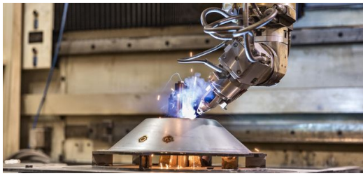
ELFIM uses the Lasercell 1005 for various applications of laser technology such as 2D and 3D cutting or welding and also for laser metal deposition.

perform a 3D scan of an existing replacement part.