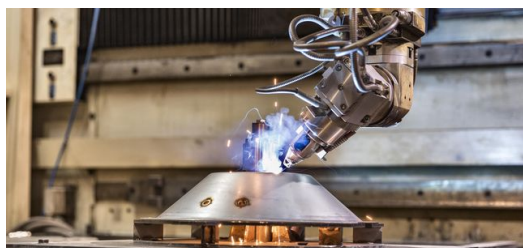
ELFIM uses the Lasercell 1005 for various applications of laser technology such as 2D and 3D cutting or welding and also for laser metal deposition.

perform a 3D scan of an existing replacement part.