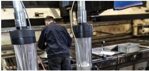
In combination with a powder feeder, the Laser cell 1005 from TRUMPF is also highly suitable for laser metal deposition.

“Strictly speaking, LMD is actually nothing new. It’s a process that has been used for many years now for repairs and coatings. However, we decided to use the process for manufacturing complete components – as is the case with this impeller here.”