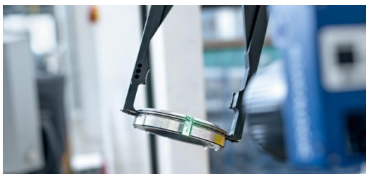
The use of data matrix codes helps standardize processes.