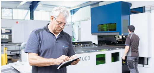
Order placement: Online ordering is standard procedure these days.

The labeling helps with the final step, namely order picking and dispatch. Here too, most of the tasks are carried out by automated functions. The person in charge of packaging is notified as soon as an order is complete, i.e. all ordered items are ready for dispatch. Thanks to smart digital networking, orders for standard tools placed before 2 p.m. can be dispatched the same day. An on-time delivery rate of 98 percent confirms the reliability of this process. Once the freight forwarder’s truck has collected the consignment of punching tools, it is delivered directly to the customer.