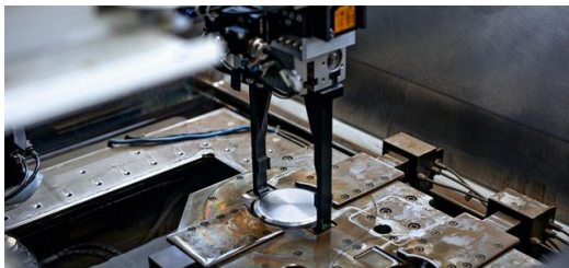
Since 2015, every blank is labeled with what is called a data matrix code.