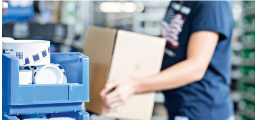
Packing: The person in charge of packaging is notified as soon as an order is complete.