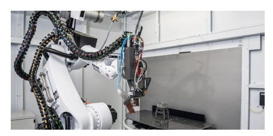
The laser network, serving a TruLaser 3030 ber and a TruLaser Robot 5020, expands the range of services offered by SCS by adding laser cutting and welding.