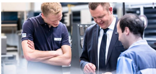
KNOLL has to store standard sizes, but also needed to be able to store sheets measuring two by four meters. That's why TRUMPF and KNOLL jointly designed a multipurpose storage system.

The ASRS is the centerpiece of any modern warehouse. It zooms vertically and horizontally from one storage space to the next, retrieving the appropriate unprocessed material and transporting it just in time to the right processing machine. Afterwards, the ASRS stores finished parts, or supplies items to other machines for additional processing. Equipment designers prioritize minimizing machine queue times and keeping travel paths as short as possible. In other words, the ASRS should move no more than necessary within the overall warehouse system. As Riebsamen knows, this is a complex challenge that demands a lot of expertise and experience – not to mention a lot of conversations about the specifics of a given customer's manufacturing environment. "We realized during the planning/design phase that we would require a lot of loading/unloading stations. We wanted to connect three laser cutting machines, a TruLaser Fiber 3030, a water-jet unit and several bending machines. TRUMPF proceeded to spell out the types and numbers of loading/unloading stations we would need and where." The TruLaser Fiber 3030, for example, is fitted with three stations. One supplies the machine with unprocessed material. A second station takes away finished parts, while a third station serves exclusively to dispose of scrap skeletons. Only three TRUMPF customers have instituted this solution thus far. Joachim Riebsamen thinks it's great: "Scrap