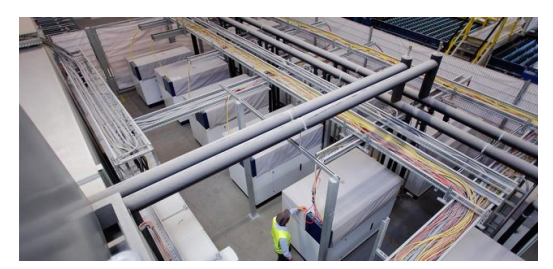
Zwölf Hochleistungslaser erzeugen 144 Kilowatt Leistung.

At the Glasstech 2016 trade fair in Dusseldorf, Saint-Gobain introduced SGG ECLAZ: a new generation of thermally insulating glass for double and triple glazing, which offers not only high light-transmittance values but also 20 percent higher energy efficiency compared to similar glass. A satisfied Lorenzo Canova adds: "Thanks to the new process, we are in a position to create brand-new products."