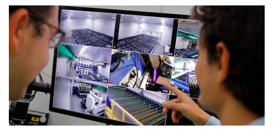
Heating the glass coating very briefly to a high temperature is an essential part of the hardening process. The glass experts at Saint-Gobain spent five years working on their rapid thermal processing method.