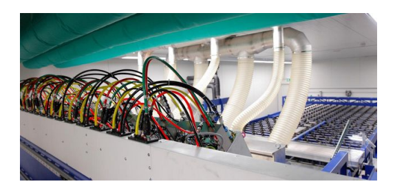
Laserlichtleitungen verbinden die Optiken mit den Lasern.