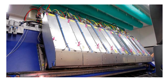
Die Boxen mit den Optiken sind in einer Brücke untergebracht, die die Förderstrecke überspannt.