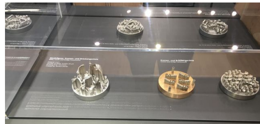
Substrate plates with 3D-printed dental prosthesis.