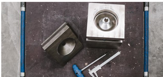
<p>The special tools developed by TRUMPF in Pasching especially for PNH, enables to automate the rigging of semicircular, bowl-shaped depressions required for the boiler plate manufacturing process.</p>