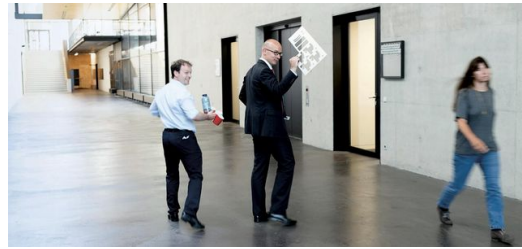
The team of people from the product group, development, purchasing, production, sales, service and project organization departments meets at regular intervals to discuss how development on the TruLaser Center 7030 is progressing.