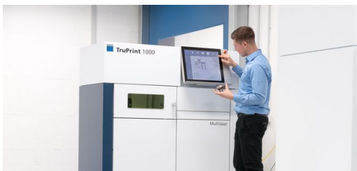
TruPrint 1000: TRUMPF's TruPrint 1000 3D printer