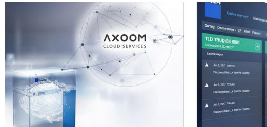
Some of the data is uploaded to the AXOOM Cloud via the Internet.