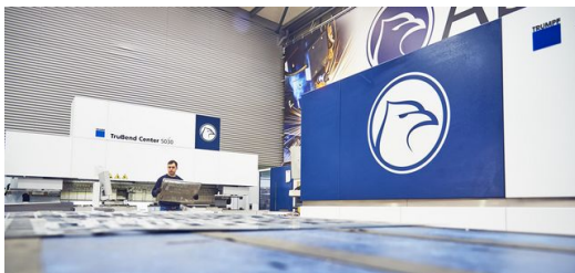
Most up-to-date technologies: Worker with the TruBend Center 5030