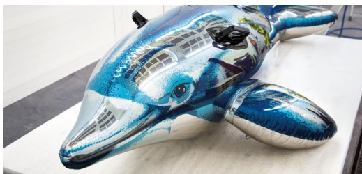
This dolphin will not be found in the water, but rather in a museum.