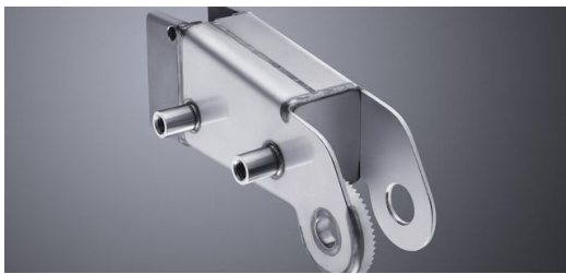
TRUMPF Medizin Systeme setzt in der OP-Tisch-Fertigung auf die Pluspunkte vom Laserschweißen.

TRUMPF helps its customers come to grips with the new joining technology by offering customer-specific workshops that cover the entire process chain. Workshops or seminars on part design lay the foundation for designs that make the most of laser welding. On top of that, TRUMPF also provides support for its customers when it comes to fixture engineering. Because “zero gap” is the measure of all things in the world of laser welding, companies need practical knowledge about suitable clamping fixtures. Taking a specific component as an example, customized workshops show participants how to cost-effectively make stable fixtures using materials from their own sheet metal fabrication operations. A further training module shows how to find the right parameters for the laser welding itself. TRUMPF expert Nikolaus Wagner explains: “The complexity of welding does not allow binding parameters such as those in the technology tables for 2D laser cutting. However, we’ve documented corridors and target values for a large number of applications, which give users very specific practical assistance and help them to achieve finished parts of the required quality in no time.”