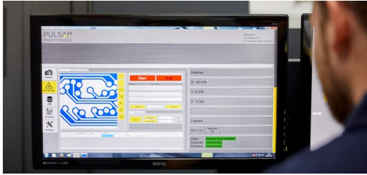
The Photonic Elements machine control software displays the ablation geometry executed during the process.