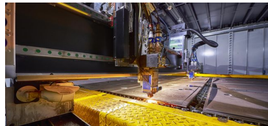
Two cutting heads equipped with 0.5 and 1 mm fibers can cut individually or in parallel (Photos: Norbert Voskens).