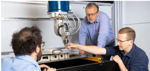
Discussing, arguing and seeking solutions together: the good cooperation between sons and father has taken the company a long way, on course for the Smart Factory.