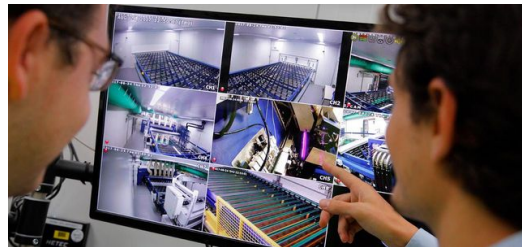
Heating the glass coating very briefly to a high temperature is an essential part of the hardening process. The glass experts at Saint-Gobain spent five years working on their rapid thermal processing method.