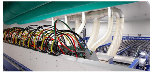
Laserlichtleitungen verbinden die Optiken mit den Lasern.