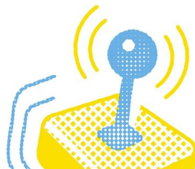
This form of remote control actually feels surprisingly fine.

What does the mouse feel about that? Does it sense it is being controlled by someone else? Or does it actually think it wants to run in a circle?