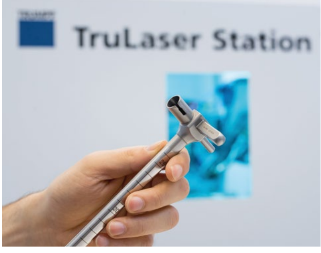
With its spacious working area and high welding quality, the TruLaser Station 7000 is especially suited for medical technology instruments such as endoscopes.