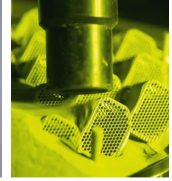
Integrated unpacking station.