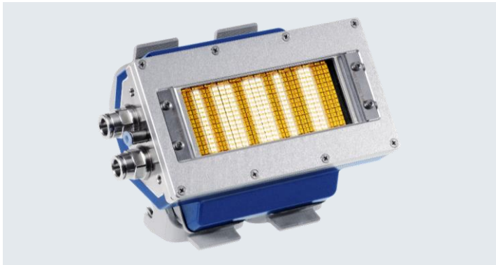
Flexible control of heating