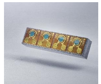
Photodiode line array