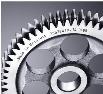
Engraving tooling or components