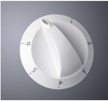
Carbonization of appliances