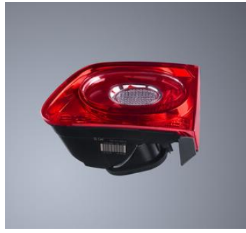
Foaming automotive parts