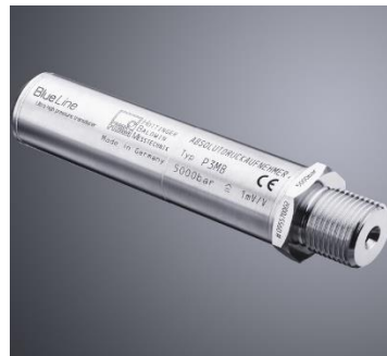
Engraving on sensors