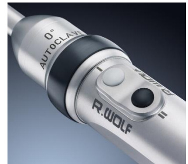
Annealing medical instruments