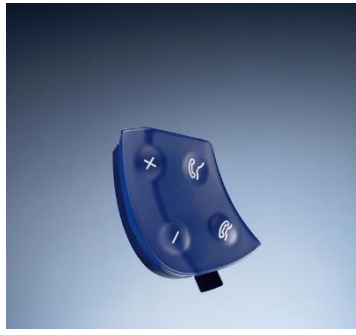
Day and night ablation