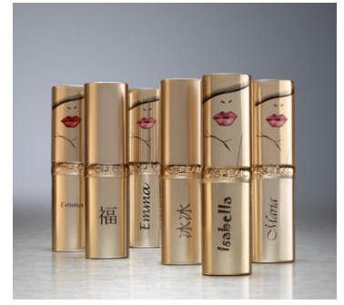
Ablation for cosmetics