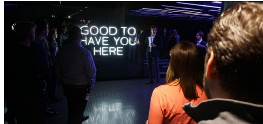
The words in the TRUMPF own tunnel system has been handcrafted exclusively for the company. Electrodes excite the gas in the tubes that form the words, making it light up.