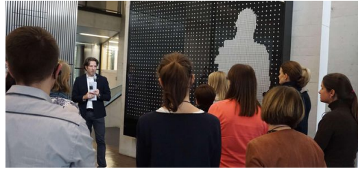
A good two dozen colleagues gathered in the lobby of the sales and service center to find out about the new Welcome Passage.