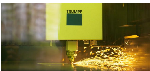
In March, FBT workers started using their new TruLaser 3030 to cut thin sheets and blanks to size.