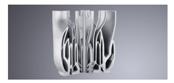
Simulations help clarify the physical processes involved in laser metal deposition and laser metal fusion and therefore improve the surface quality.<br/>dr />Picture: Yousub Lee

The 3D model explained above was extended to an LMD process with multiple layers on a single track to investigate the influence of fluid convection on melt pool formation and deposit build dimension. Unlike single deposition on a flat substrate, the laser beam and powder particles are projected onto a convex free surface as the layers are stacked. Due to Marangoni shear stress and particle addition, fluid circulation occurs in a melt pool with a convex surface. The simulation showed that the shape of the bottom of the melt pool continually shifts from flat to convex as the build height increases.