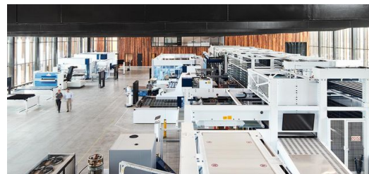
In a production hall measuring 55 meters in length, there is a connected sheet metal production with a central storage system as the centerpiece, which supplies the machine tools with material.