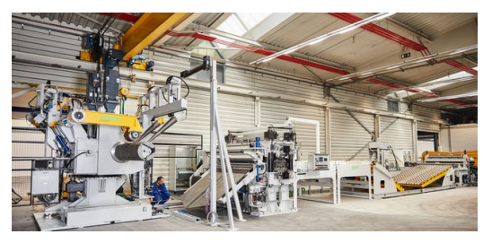
As well as the TRUMPF VarioPress 500, Wagner has also invested in a new decoiling system.