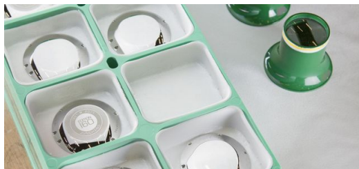
In the new generation of TruMicro Mark Series 2000 ultrashort pulse lasers, the pulse duration can be variably set between 400 femtoseconds and 20 picoseconds. This enables fast, burr-free engraving of up to 100 micrometers deep in all precious metals that can be reproduced at any time with consistent quality.