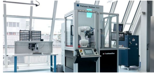
Efficient duo: At the Widnau site in Switzerland, endoscope manufacturer Karl Storz welds eyepieces on a TruLaser Station 7000. A mobile robotic cell takes care of loading and unloading the components.