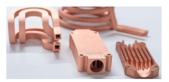
Not only materials like aluminium and stainless steel can be printed – also pure copper and gold are available.