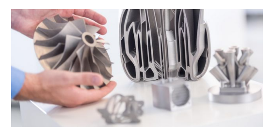
Aerospace, Automotive or Medical: The applications for 3D printing are just as diverse as the technologies and materials. But what are the main trends?

Another aspect of the trend toward multiple elements is the idea of combining 3D printing with other machining methods in a single machine, for example with milling and drilling. Unfortunately, that typically ends up transforming the unquestionable marvels of 3D printing into an annoying drag on the other built-in processes. Right now – and even in the longer term – the difference in processing speeds between 3D printing and traditional methods is simply too great to offer any good reason for combining them in the same machine. That is no longer the case for other additive manufacturing methods, however, such as laser metal deposition.