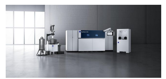
How much automation does 3D printing need? Currently, rather large companies ask for complete automation solutions. Classic job shops prefer to operate the systems alone.