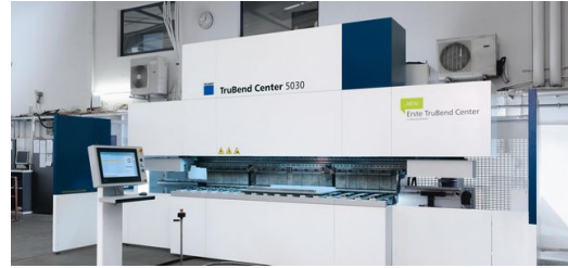
Since December of 2014 the first TruBend Center, built by TRUMPF, has been on site at Bickel Blechtechnik. There it makes for previously unconceivable diversity in the parts it produces.