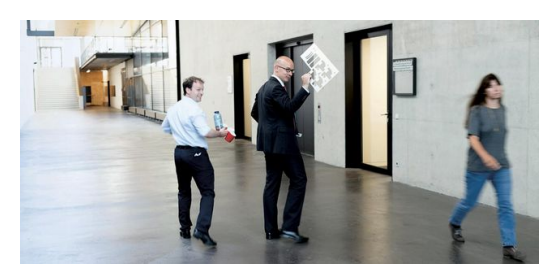
The team of people from the product group, development, purchasing, production, sales, service and project organization departments meets at regular intervals to discuss how development on the TruLaser Center 7030 is progressing.