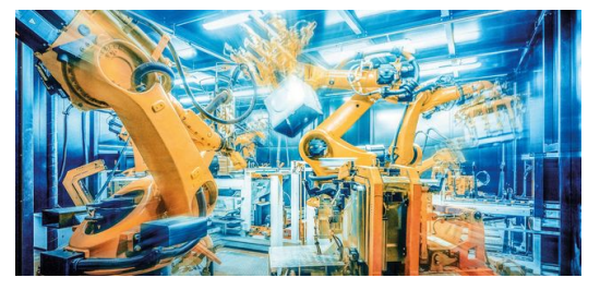
In manufacturing Industry 4.0 will lead to an unprecedented push for flexibility. Optical sensors and measurement devices will provide the data needed.