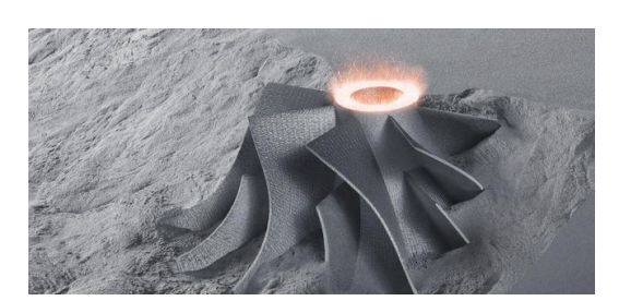
3D printing will become an important new manufacturing method leading to massive cost saving.